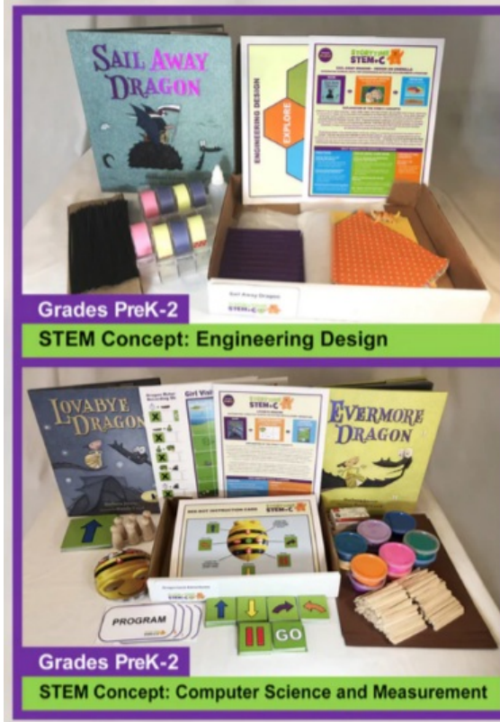
Grades PreK-2 STEM Concept: Engineering Design